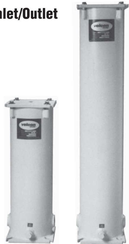
VF81SYS150 (left) and VF82SYS150 (right) Filter Housings