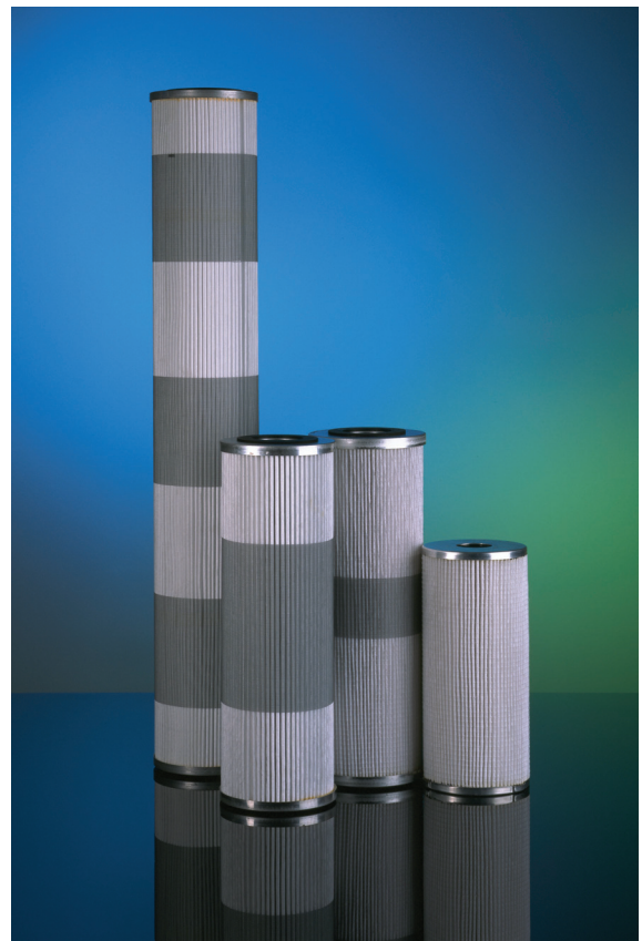
FOS-636PLP8 , FOS-618PL1/2, FOS-618PL8, FOS-512PL25

FOS-618PL05 and FOS-636PL05 have a nominal 5 micron filtration rating. They provide improved filtration for synthetic-based compressor lube oil applications.