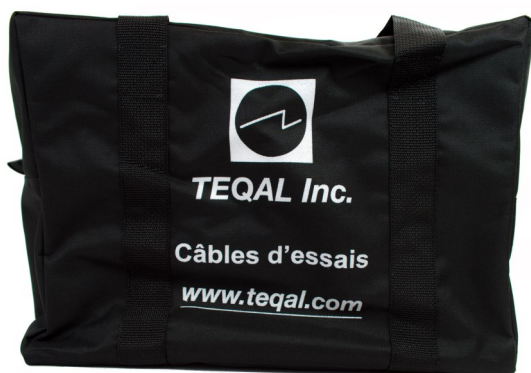
TE-SC1 SAC DE TRANSPORT