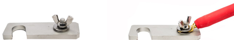
TE-ADAPT-200/10 Adaptateur 200A-10A